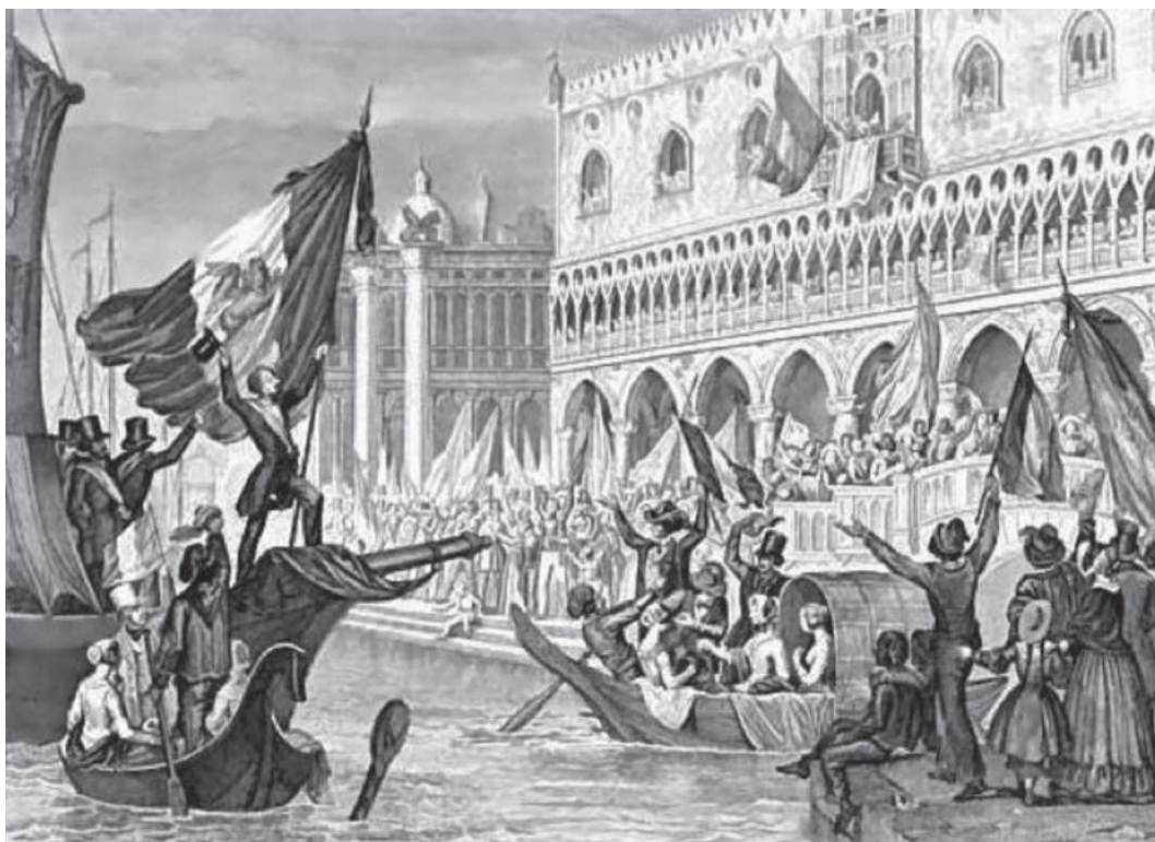
A drawing from the time of Daniele Manin proclaiming the Republic of Venice in 1848.