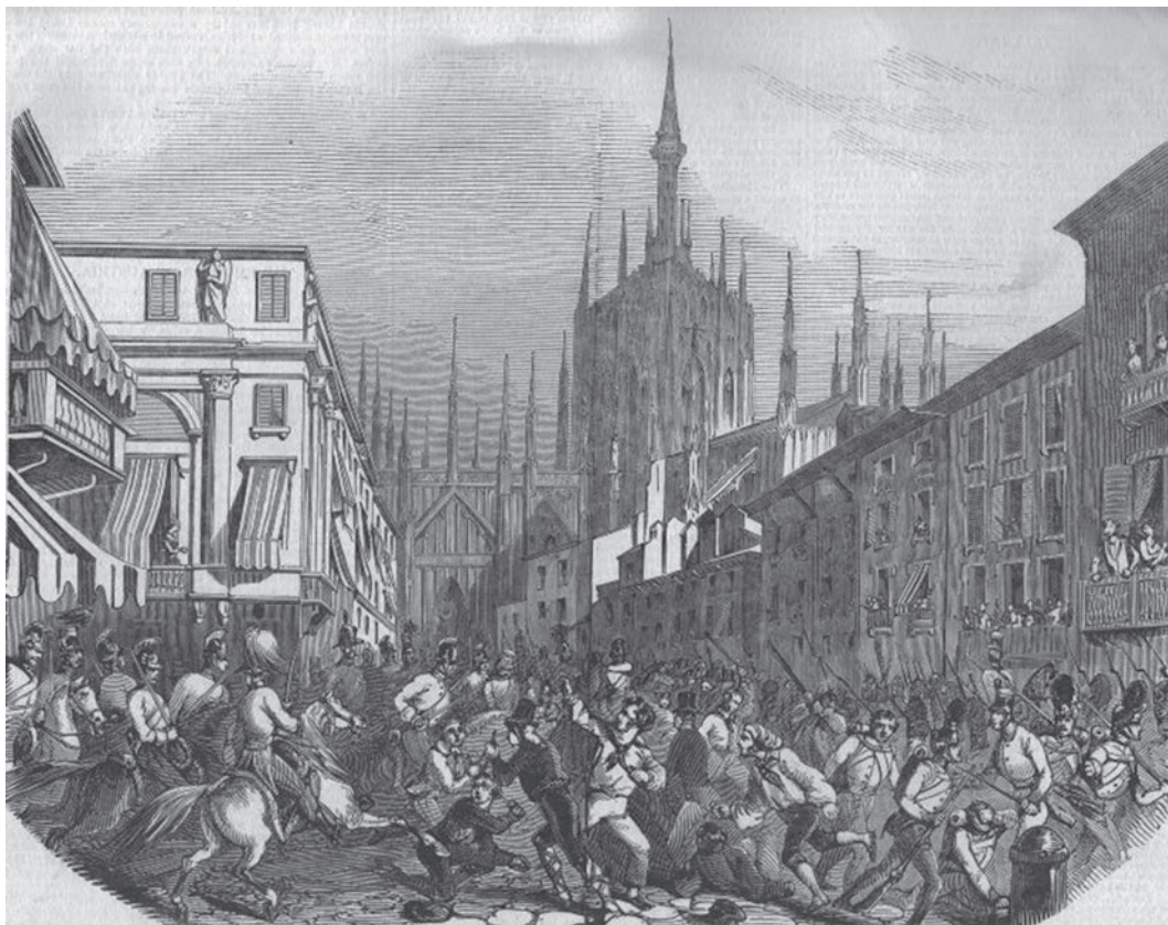
A drawing from the time of the uprising in Milan in March 1848.